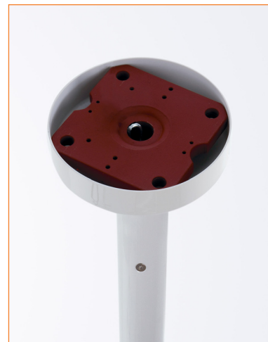
TS1520 Mounting plate for stationary ceiling columns